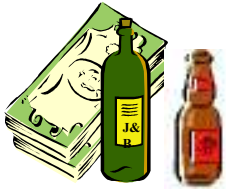
Chart of Accounts

Things you Own Cash, Inventory Building, property